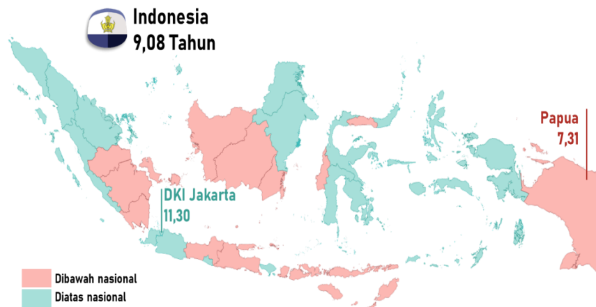
Figure 2. The Residents' Economy

Furthermore, the degree of alienation or isolation is another distinguishing feature of a marginalized group (Suyanto, 2005). This only happens for a reason, as evidenced by the uneven development of educational facilities and infrastructure in every region of Indonesia. The average length of schooling in each province of Indonesia describes a country's population's academic level and the quality of its human resources. Middle Years Schooled (read: Rata Rata Lama Sekolah/RLS) is the number of years spent in formal education by residents, excluding years spent by residents who repeat because they do not attend class. High RLS achievement indicates that the educational system is performing well (Unesco, 2009). The average length of schooling for residents aged 15 and over in Indonesia by the province in 2022 is shown below.