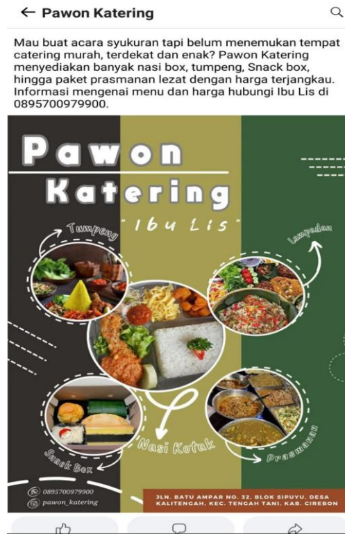
Figure 2. Marketing Through Facebook Media

The marketing system through Facebook media has not been able to run optimally because not many potential customers are interested in using Mrs. Lis' services, but the marketing system is still being implemented.